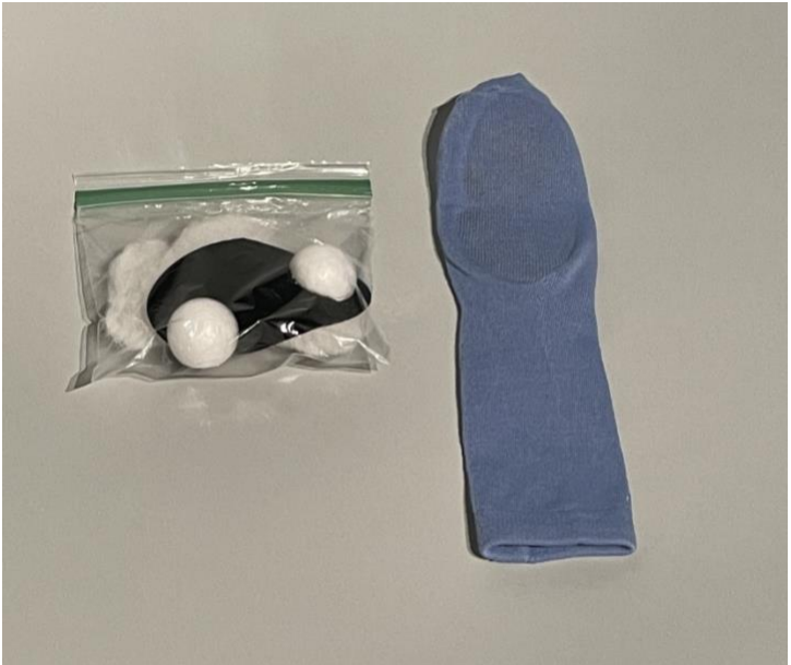
If you have a kit, start with the bag for facial features.

• Mouth. Use the larger self-adhesive black felt oval to create the inside of the mouth. In your bag is also a self-adhesive red tongue. Markers can also be used to color the mouth.