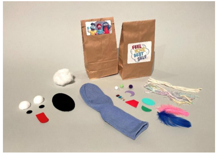
A sample puppet-building kit.

• Put the sock on your hand. Can you make the sock talk or breathe?